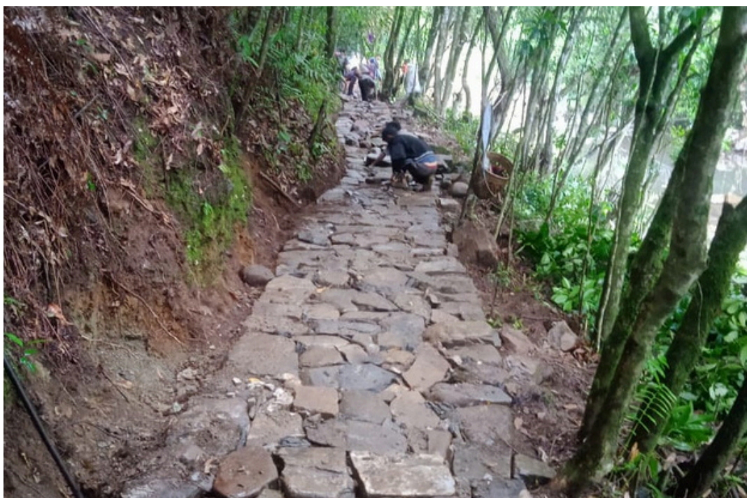
The construction of an eco-footpath as part of community development efforts, funded by GREEN Meghalaya for Year 2, located outside the forest boundary at Dorbar Shnong Khlieh-a-sem in Mawkyntrew Block, East Khasi Hills.