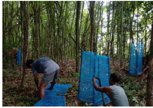
ANR ,Gap plantation done at Ganipara reserve